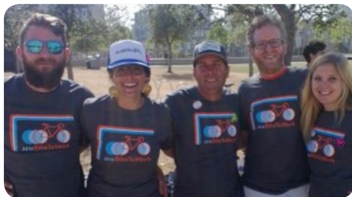
SAN DIEGO BIKE COALITION STAFF

Since 1987, we have acted as voice for bicyclists in the region and have advocated for safer streets and hundreds of miles of bike paths, lanes and trails all across the San Diego region. We conduct educational programs, promote awareness of bicyclists and bicycling issues, review infrastructure improvements, and act as a voice for bicyclists to elected officials and decision makers all over San Diego County.